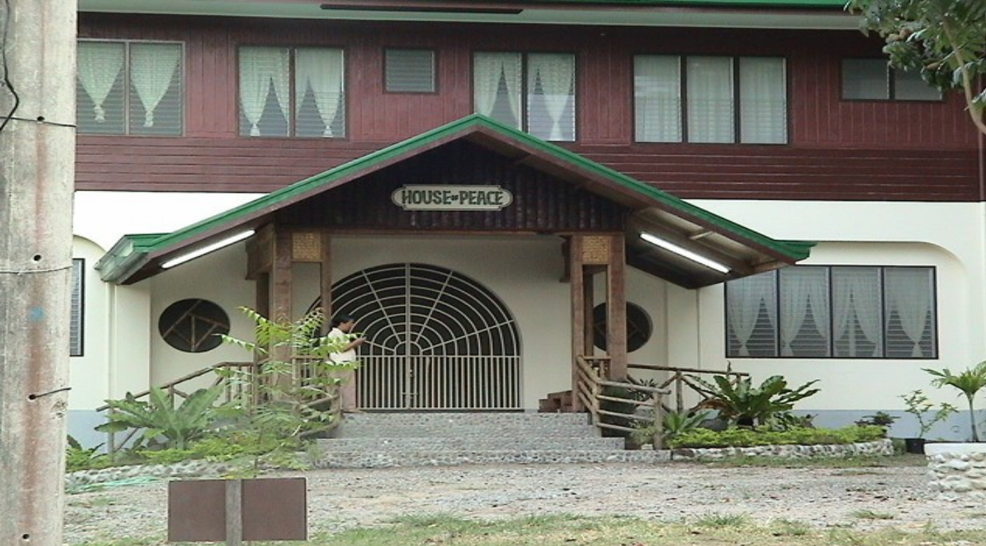
House of Peace