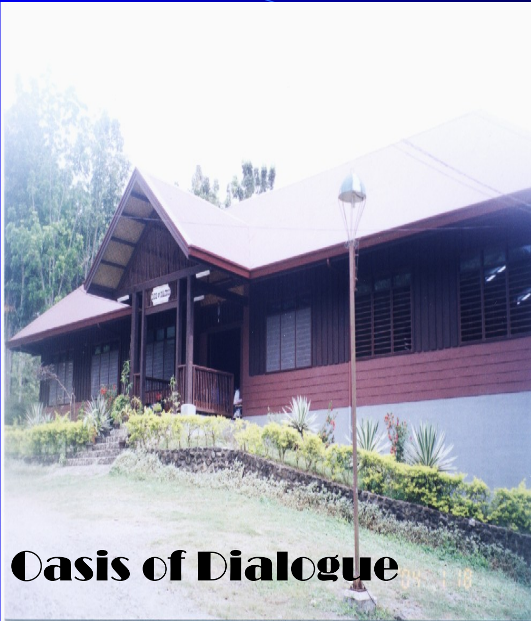
Oasis of Dialogue