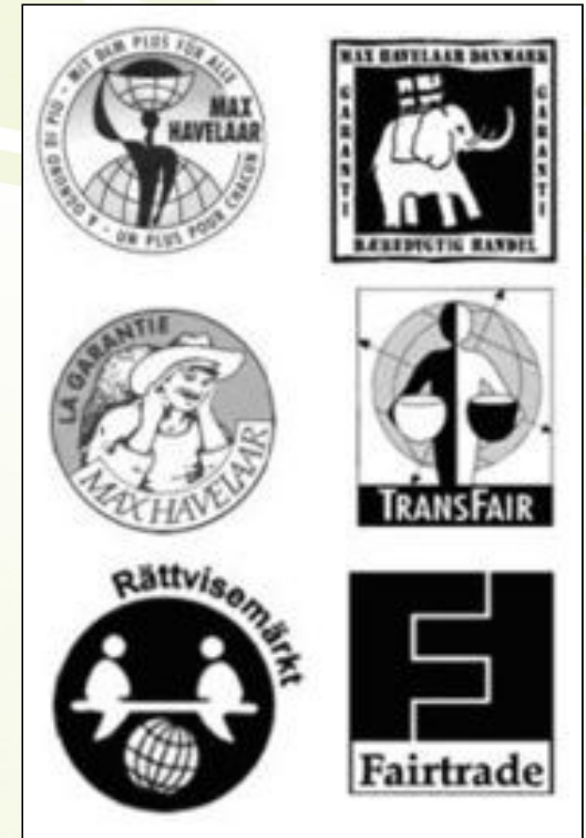
Old Fairtrade logos